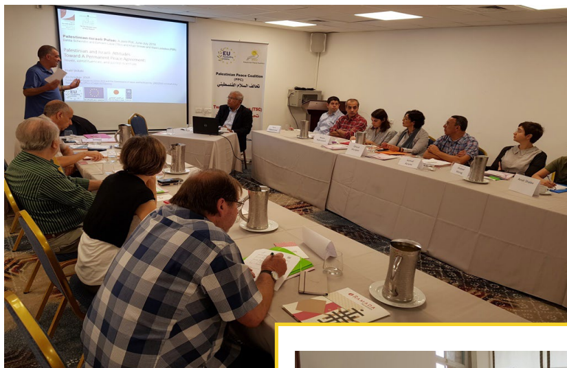
Palestinian and Israeli TSC members during a joint seminar in Nazareth. October 2018

The international community is a critical player in the peace process. Members of the TSC led by the Directors General of the PPC and HLEP visited Brussels and The Hague to meet with EU stakeholders and officials, updating them about the status of the two-state solution and raising awareness about the reality on the ground in light of recent political developments that put the two-state solution at great risk. EU intervention is much needed at this phase to protect the two-state solution, so these meetings are a forum for Palestinian and Israeli organizations to discuss the role of the EU in the Middle East Peace Process (MEPP) and call for a more effective intervention from the EU and EU member states.