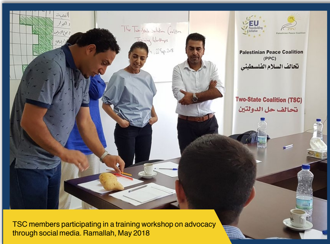
TSC members participating in a training workshop on advocacy through social media. Ramallah, May 2018

During the first year of the TSC project, the PPC and HLEP brought together 23 organizations from both sides as members of the TSC representing different geographic areas, as well as different fields of work, including organizations led by youth and women. The TSC members attended enrichment seminars, held briefings about pressing issues (Israeli elections and the Trump Plan, to name a few), and organized advocacy meetings. Also, the TSC commissioned a public opinion poll to test the public's attitudes towards the two-state solution – see more details in page 5.