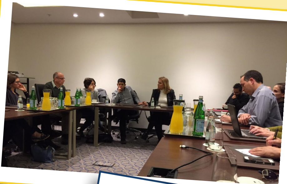
TSC members meeting with Tzipi Livni, former member of the Knesset and former opposition leader. January 2019