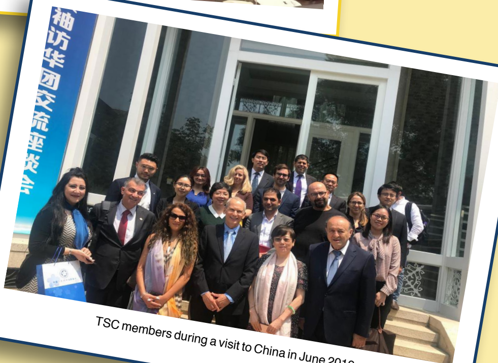
TSC members during a visit to China in June 2019